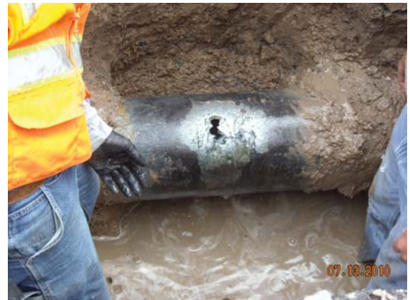
(Failure of a 35-year-old ductile iron pipe)