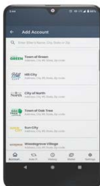
Now available for Android